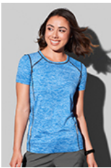
ST8940 Recycled Sports-T Reflect