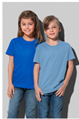
ST2200 Classic-T Kids