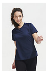
SOL'S SPORTY WOMEN 01159