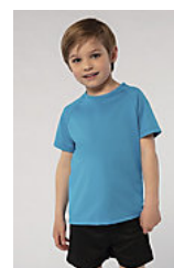
SOL'S SPORTY KIDS 01166