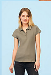
SOL'S PRESCOTT WOMEN 11376