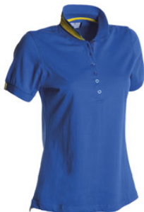
ROYAL BLUE/YELLOW- NAVY BLUE