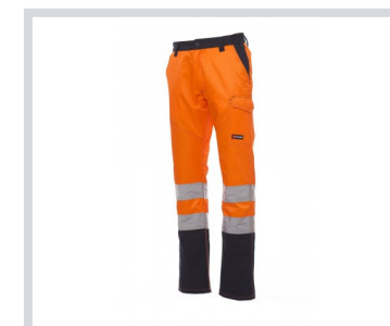
FLUORESCENT ORANGE/NAVY BLUE