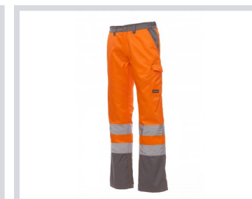
FLUORESCENT ORANGE/STEEL GREY