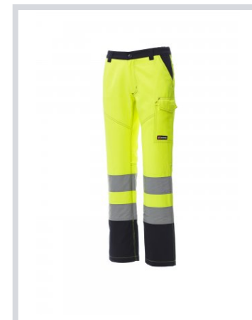
FLUORESCENT YELLOW/NAVY BLUE