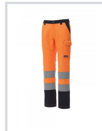
FLUORESCENT ORANGE/NAVY BLUE