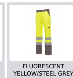
FLUORESCENT YELLOW/STEEL GREY