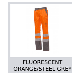
FLUORESCENT ORANGE/STEEL GREY