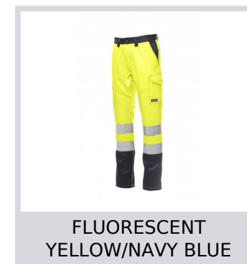
FLUORESCENT YELLOW/NAVY BLUE