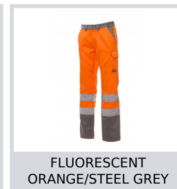
FLUORESCENT ORANGE/STEEL GREY