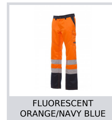
FLUORESCENT ORANGE/NAVY BLUE