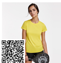
MONTECARLO WOMAN CA0423