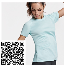
BAHRAIN WOMAN CA0408